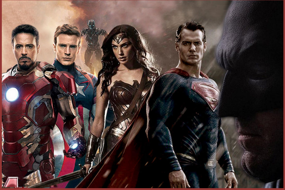
Upcoming movies: Marvel's Civil War & DC's Batman vs. Superman

That being so, there are a select few that everyone's eyes are fixed on. It's a mixed bag of reboots, sequels, and brand new heroes, doling out something for everybody. We don't know for sure whether any of these will be good or bad, but what we do know is that people are looking forward to the release of them nonetheless.